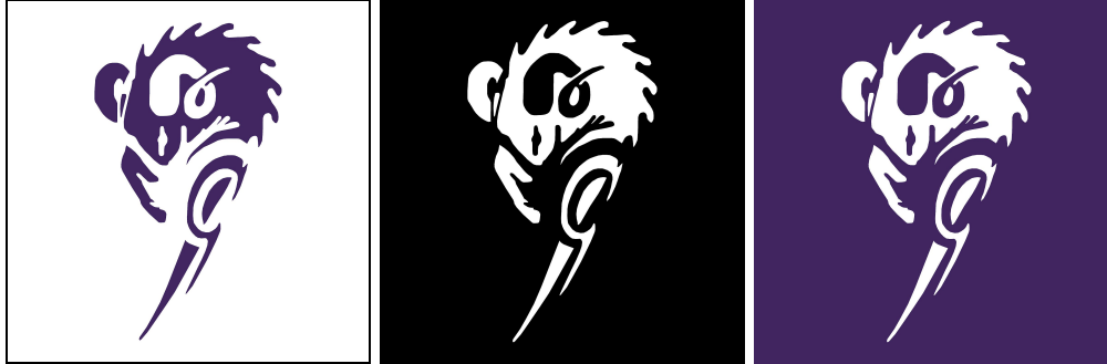
Purple on white